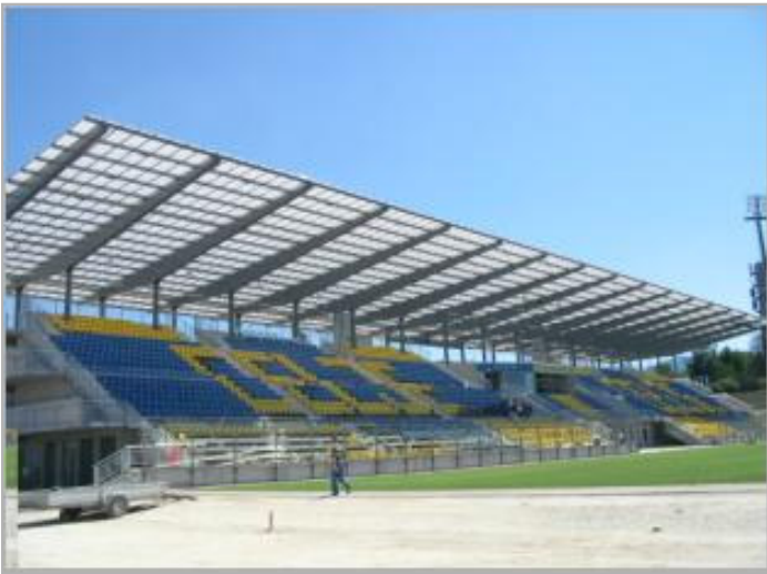
Celje Stadium, Slovenia

In addition to roofing and escalator enclosures, SABIC Innovative Plastics' ThermoClear sheet products have been used in separation walls, dugouts, balconies, walkway enclosures, and entranceways.