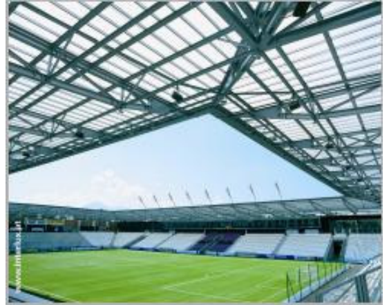
Above and below photos are Salzburg Wals-Seizenheim Stadium with Lexan* Thermoclear Sheet roofing