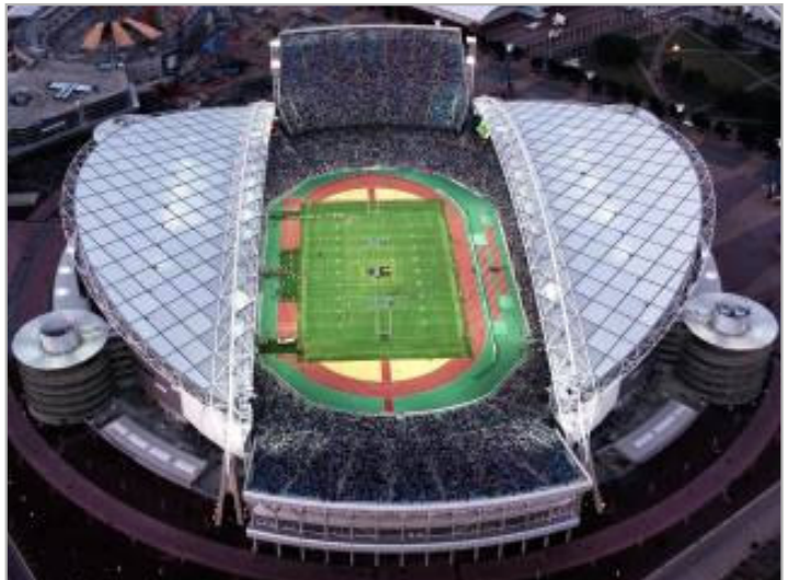
Sydney Olympic Stadium