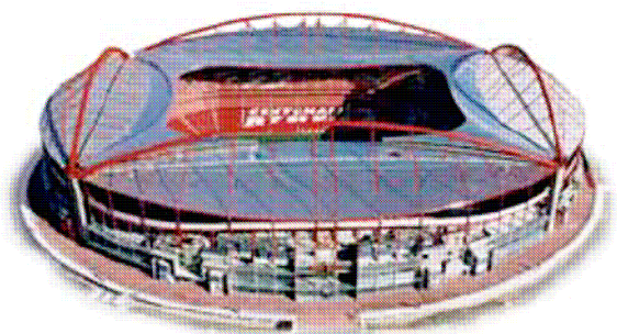
Lisbon, Luz stadium