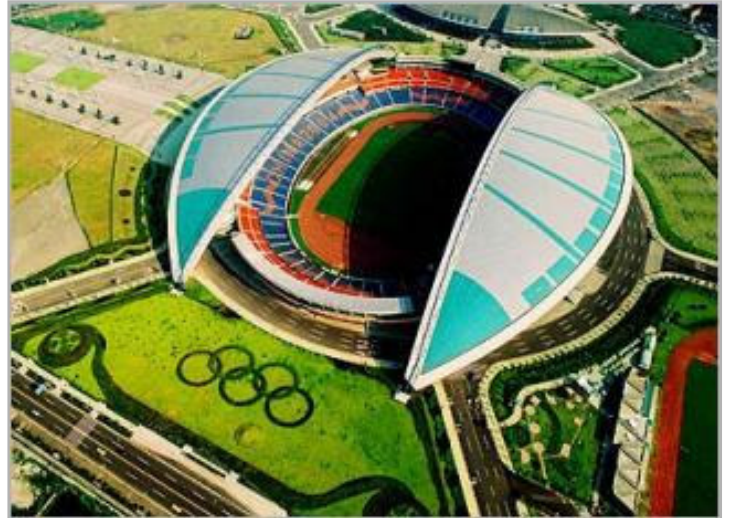
Chongqing Olympic Stadium, China