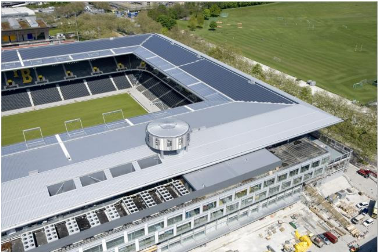
Stade de Suisse Wankdorf Stadium in Bern with Lexan* Thermoclear Sheet roofing