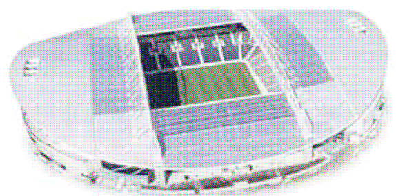
Porto Dragão stadium